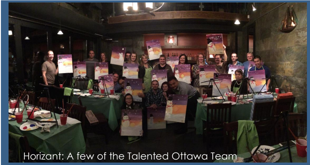
Horizant: A few of the Talented Ottawa Team