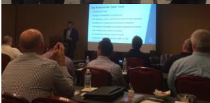
Horizant Team & VIP BPs - Dec 2016 Nashville TN