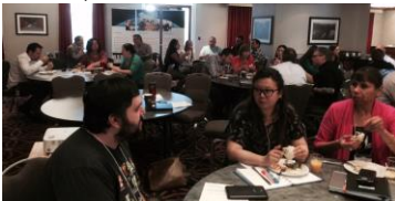
CDN Fed Gov

CDN FED GOV Workshop: Held at Four Points by Sheraton, Gatineau in June 2016.